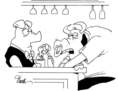
"Things were going great until she suggested we go to a china shop."